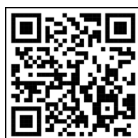
B. Com Finance