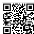
B. C. A.