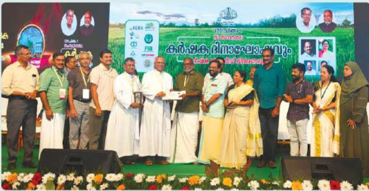
Agriculture Award Received from Shri. P. Prasad, Hon'ble Minister of Agriculture, Govt. of Kerala