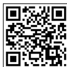
B. Com Professional