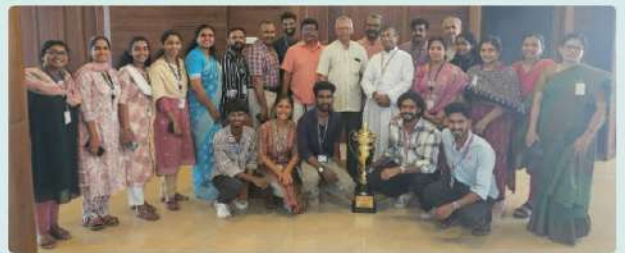
Christ College became the D-Zone Champions for the second consecutive year