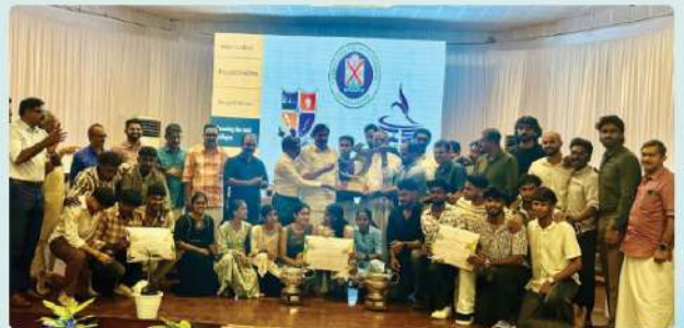
Christ College won the Overall Sports Championship Award for the ninth consecutive year in the University of Calicut