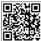
B. A. Economics