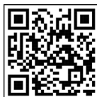
B. Sc. & M. Sc. Computer Science